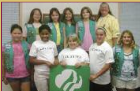
Girl Scout Junior Troop 447 from Lake City participated in a United Way photo shoot.