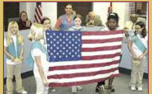
Troop 17 from Lake City led the pledge of allegiance at the City Council meeting!