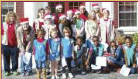
Carolina Hills Service Unit warmed hearts with their Christmas Caroling event.

To feature your accomplishments here, email "Shout Outs" to communications@girlscouts-gateway.org or send to the communications department at the Jacksonville Service Center, 1000 Shearer St, Jacksonville, FL, 32205