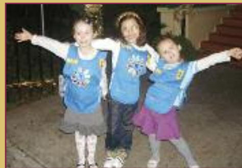
Troops 1225 and 1215 from Springfield celebrated the holidays by caroling during the Springfield Historic Home Tour . They sang traditional and non-traditional Christmas, Hanukkah, and Kwanza songs for everyone to enjoy.