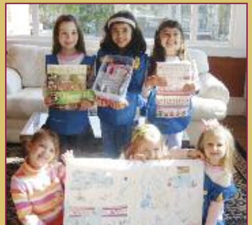
Daisy Girl Scout Troop 1225 from Springfield participated in the Samartian's Purse Operation Christmas Child the girls wrapped and decorated shoe boxes with holiday stencils and drawings, then filled them with love and gifts for children in need ( these three went to little girls in Africa ).