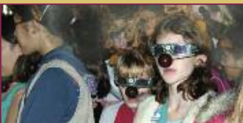
Girl Scouts from St. Augustine Service Unit collected Christmas gifts to provide 210 foster kids in St Johns County with toys for the holidays. More than 350 Girl Scouts from St. Augustine also enjoyed caroling at the annual Night of Lights celebration in down town St. Augustine.