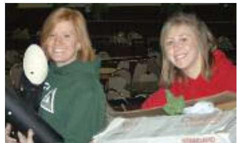
Kappa Deltas help turn the Moroccan Shrine into "A Grecian Dream" for the father-daughter ball